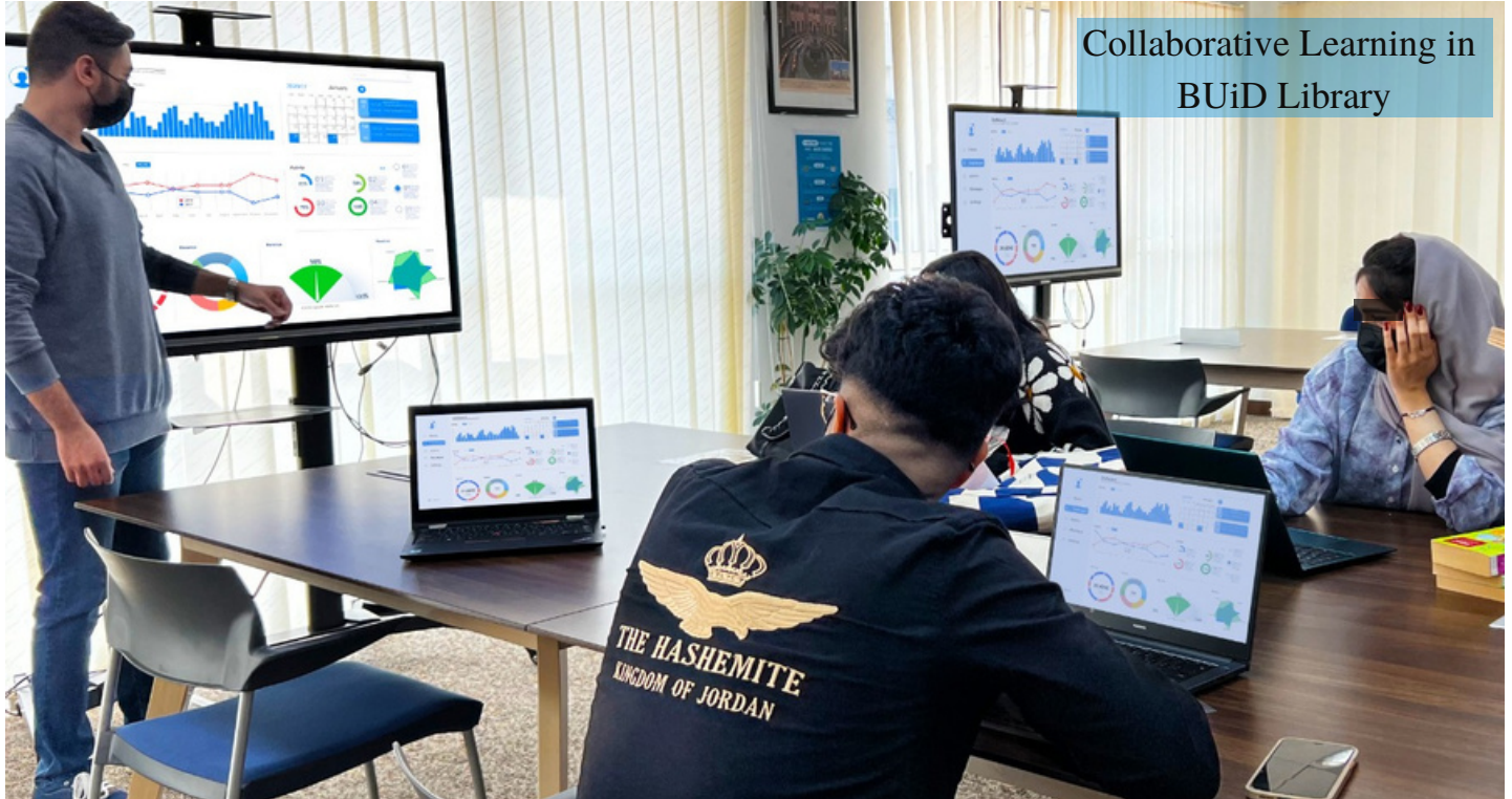
Collaborative Learning in BUiD Library

The official e-newsletter of BUiD's Library