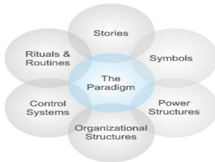
Figure 2.1: Cultural Web Framework (Johnson and Scholes, 1997)

addition a distinctive organisational culture would ensure that all organizational aspects target the common end and it will increase the firm competitiveness as it will be very difficult to imitate such culture by other competitors in the market. Johnson and Scholes (1997) defined the fundamental elements of culture in comprehensive framework called “cultural web” (see figure 2.1). This framework gives a broad understanding of cultural influences on organisational behaviour and its impact on the organisational performance which took place due to these cultural elements.