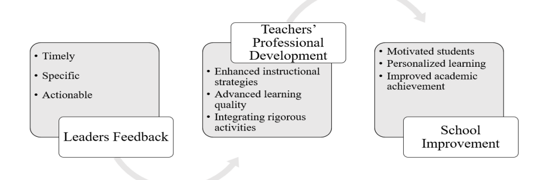
Figure 3:The Relation between Leaders' Feedback, Teachers' Professional Development and School Improvement