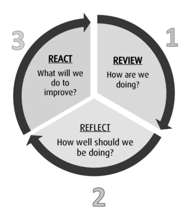
Figure 3.1 KHDA Self-evaluation cycle (KHDA 2016)